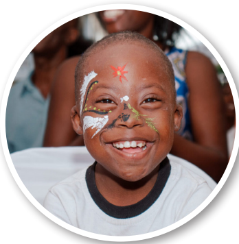
Night to Shine Participant

PSPG, located in the heart of this turmoil, continues to provide education and hope to its students, but the situation is becoming more precarious. In light of these threats, we ask for prayers for the safety of the school, its students, and staff. Please pray for protection from the violence surrounding them and for wisdom in navigating these dangerous circumstances. We also pray for peace to return to Haiti and for divine intervention to bring confusion and dissension among the gangs, halting their progress.